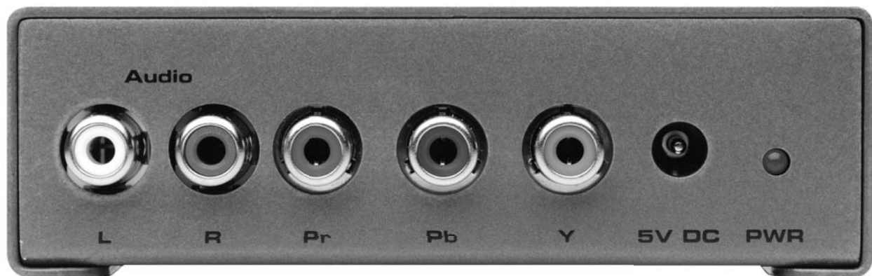
L+R Audio Inputs