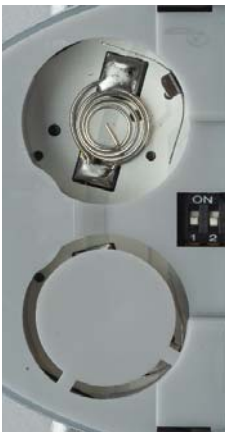
Remote Channel 1: Default

The DIP Switch bank on the RMT-4IR is located underneath the battery cover. DIP Switch banks for the 4x1 DVI KVM Switcher are located on the underside of the unit beneath a piece of metallic-like tape. The DIP switch bank (4 switches) is for the adjustment of remote control frequencies and switch behavior. Switches 1 and 2 on the RMT-4IR directly correspond to DIP Switches 1 and 2 on the 4x1 DVI KVM Switcher. Only switches 1 and 2 (of 4 in that bank) are used for IR Code settings.