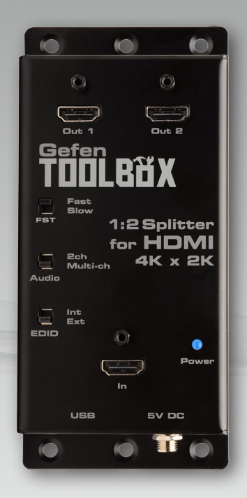
Stretch it, Switch it, Split it. Gefen's got it. ®

20600 Nordhoff St., Chatsworth CA 91311 1-800-545-6900 818-772-9100 fax: 818-772-9120 www.gefen.com support@gefen.com